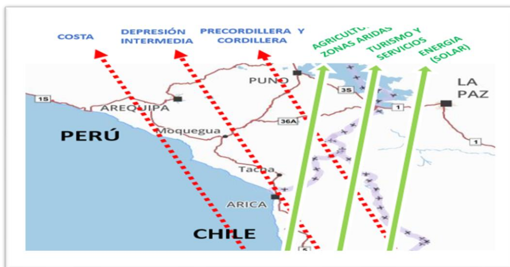
Figure 3. Interrelationship between geographical areas and economic sectors on the Peru-Chile border

Specifically, the role of the agricultural sector, within the framework of cross-border development, aims to create conditions for the development of competitive and efficient markets for agricultural goods and services, and reduce inequality and poverty, seeking synergies with linked private agents of the sector. The main engine that drives the successful growth of export agriculture and the diversification strategy has been the private sector. To achieve development and sustainable goals as well as to respond to new priorities and changing circumstances, it is necessary to maintain quality parameters and increase the availability of specialized human capital in the management of advanced agricultural technologies, required for the management of production processes in desert ecosystems, as well as address research processes associated with creation of new knowledge.