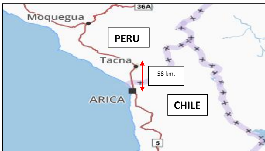
Figure 1. Map of the border area Tacna (Peru) - Arica (Chile)

The Arica and Parinacota Region - Chile and the Department of Tacna - Peru, are bordering regions that are located at a distance of approximately 58 km and maintain a dynamic and permanent contact.